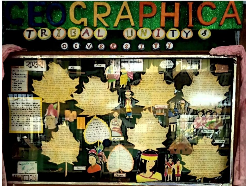
DEPARTMENT OF GEOGRAPHY