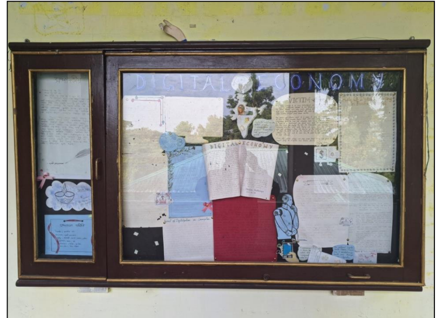
DEPARTMENT OF ECONOMICS