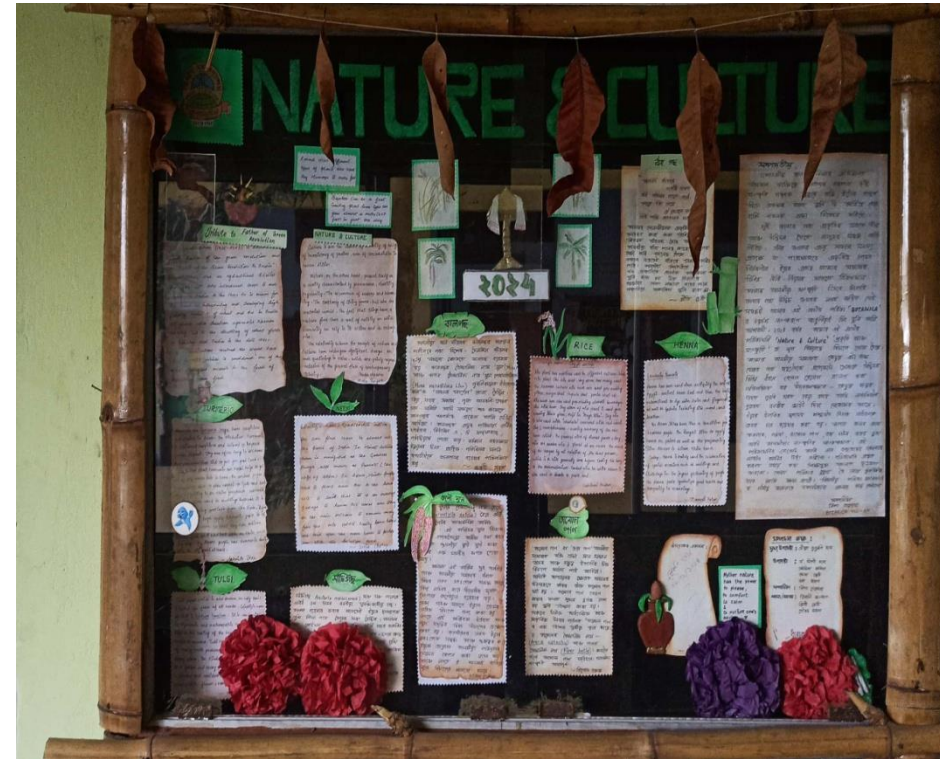
DEPARTMENT OF BOTANY