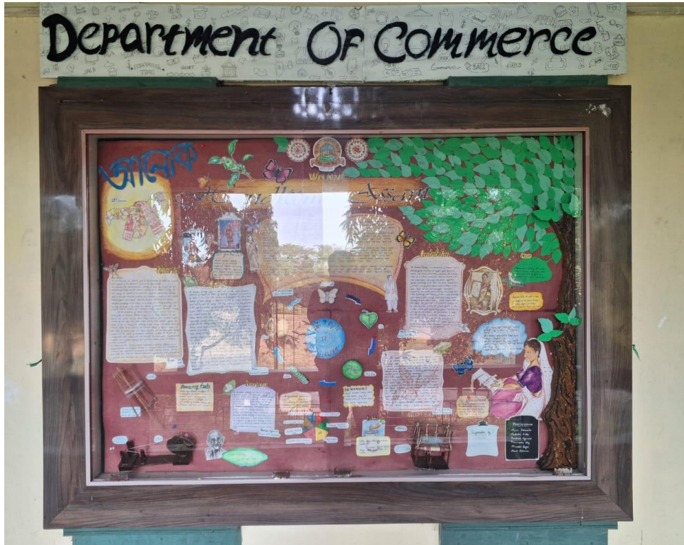
DEPARTMENT OF COMMERCE